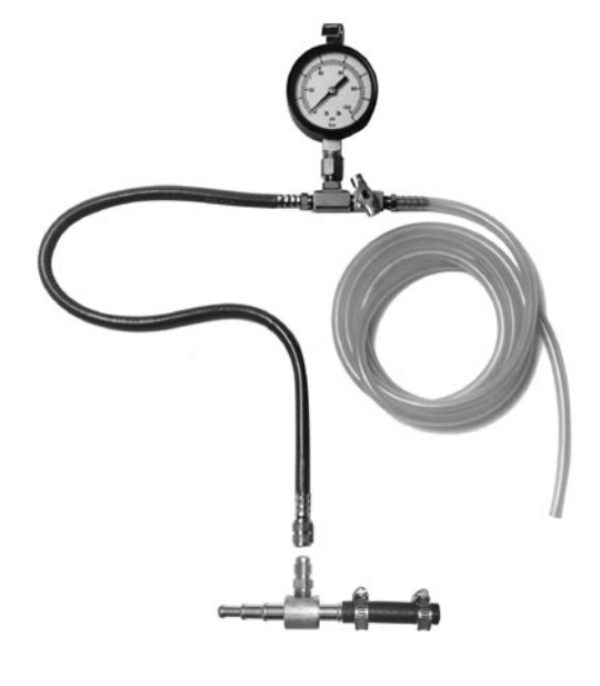
NOTE: This is only one of several hook-ups which can be made.